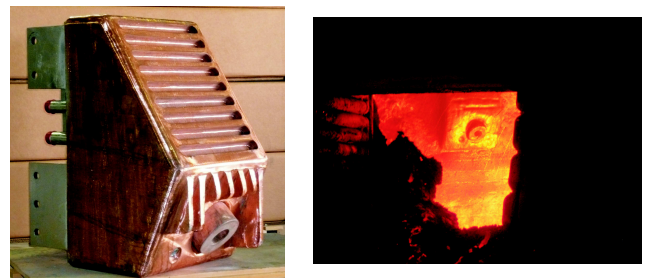
Fig. 2. JetBOx TM unit – stand alone and inside hot furnace

Typical JetBOx unit including the burner – injector and installation inside hot furnace is shown at Figure 2.