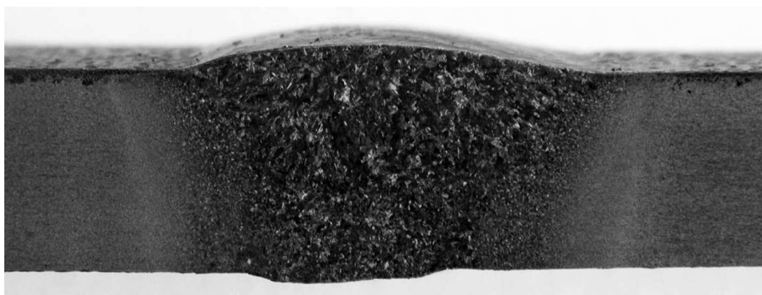
Fig. 1. Macrostructure of a welded joint, Nital etching, magnification ~6x

Microstructural examination has failed to reveal microcracking as well as confirmed the correct microstructure in all regions of the homogenous welded joint. The examinations of the welded joint microstructure were performed in all regions of the welded joint (Fig. 2). Parent metal – steel T24 had a fine-grained bainitic microstructure (Fig. 2a, 2b). According to the research [7] this microstructure is the most desirable microstructure of T24 steel in the initial state (subsequent to heat treatment) in the case of production of homogenous welded joints. On grain boundaries in parent material isolated large, approximately 1µm carbides (frequently precipitated in the contact area of three grains' boundaries) have been revealed. So called continuous network of precipitates on boundaries have been observed as well. Grain size determined basing on diagram examples [8] for parent material was 9.5; which corresponds to average grain diameter of 13.1µm. In the welded joint lower bainite microstructure was found (or a mixture of lower bainite with martensite) with numerous carbides of various sizes, precipitated both on prior austenite grain bounda-