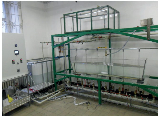
Fig. 1. Physical model of the investigated device

on the designated criteria of similarities between the model and test industrial applications. The view of the test stand of the continuous casting device is presented in Fig.1. By using the physical model, there were performed research tests based on visualization and tracer concentration distribution was determined in the form of Residence Time Distribution (RTD) characteristics (of type F [10,11]). Aqueous solutions of \text{KMnO}_4 [12] and NaCl are used as markers in the model.